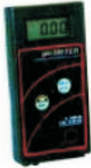
Portable pH Meter