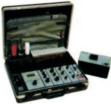
Deluxe Water Analysis Kit