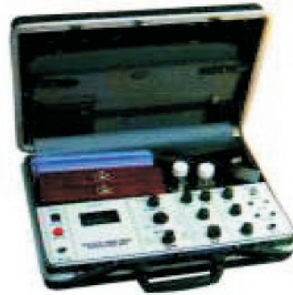
Water & Soil Analysis Kit