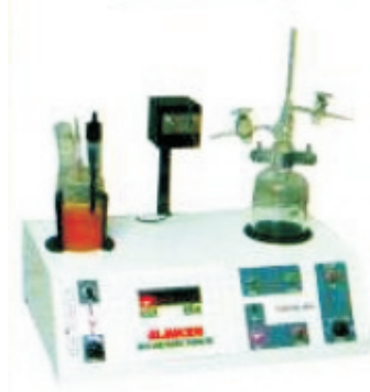
Digital K.F. Titrimeter