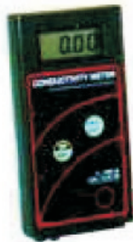
Portable Conductivity Meter