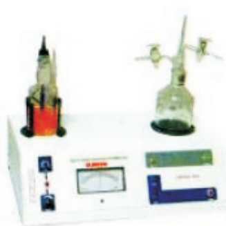
Analog K.F. Titrimeter