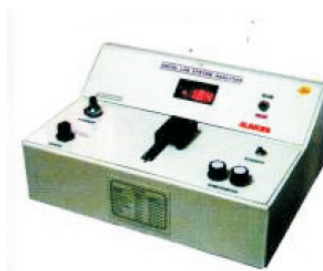
Lab System Analyser