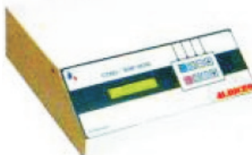
Microprocessor Cond. TDS Meter