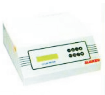
Microprocessor pH Meter