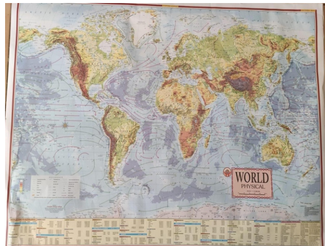
WORLD PHYSICAL ENGLISH