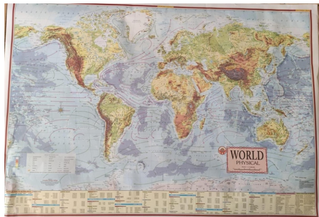
WORLD PHYSICAL ENGLISH