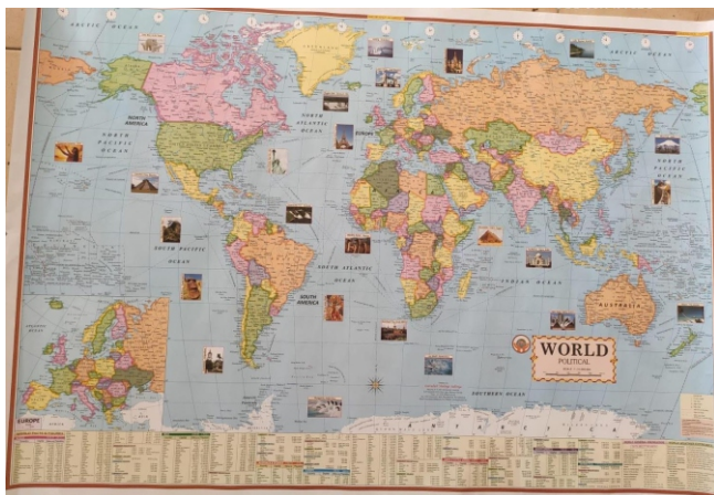
WORLD POLITICAL ENGLISH