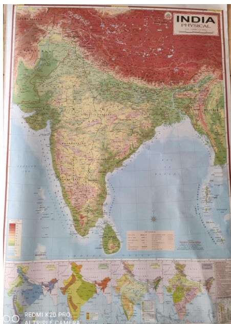
INDIA PHYSICAL ENGLISH