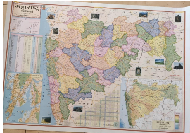
MAHARASHTRA POLITICAL MARATHI