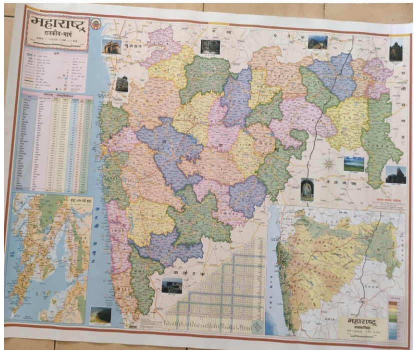
MAHARASHTRA POLITICAL MARATHI