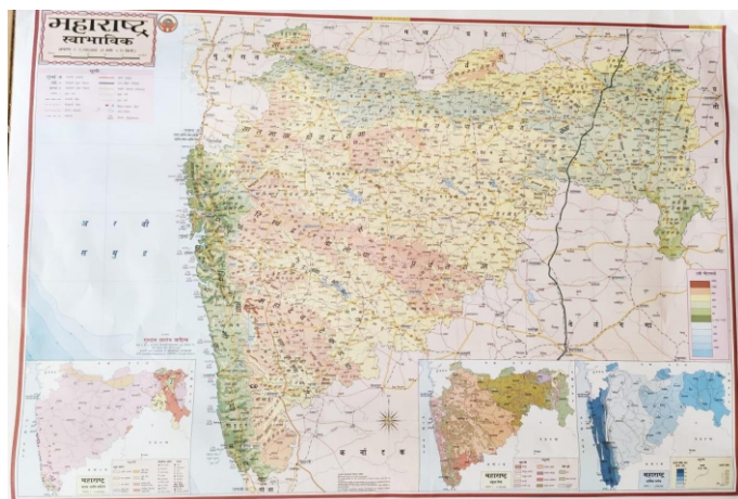
MAHARASHTRA PHYSICAL MARATHI