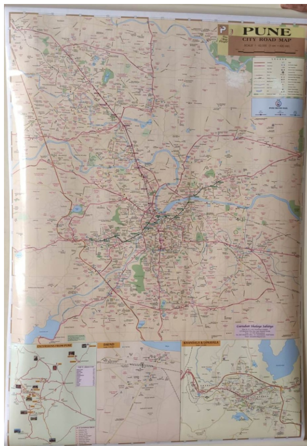
PUNE CITY ROAD MAP ENGLISH