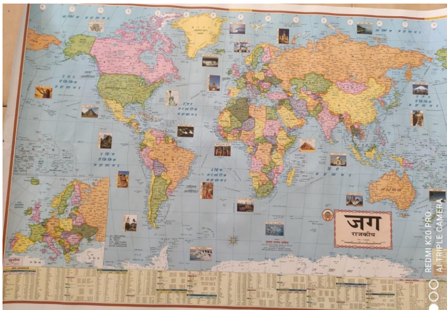
WORLD POLITICAL MARATHI