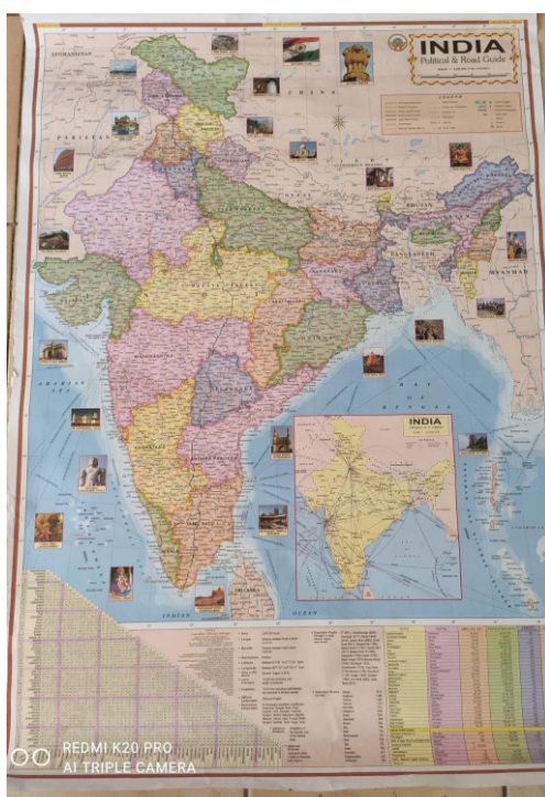
INDIA POLITICAL AND ROAD GUIDE ENGLISH