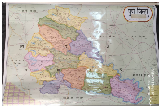
PUNE DISTRICT MARATHI