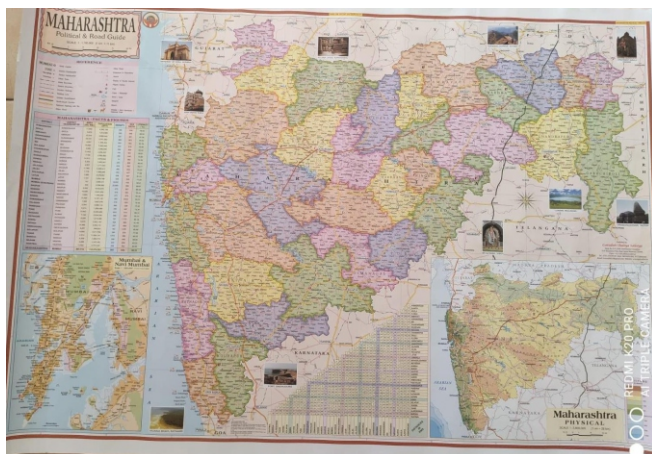
MAHARASHTRA POLITICAL ENGLISH

For Set of 7 Rs. 400/- AFTER DISCOUNT OFFER Rs. 276/-