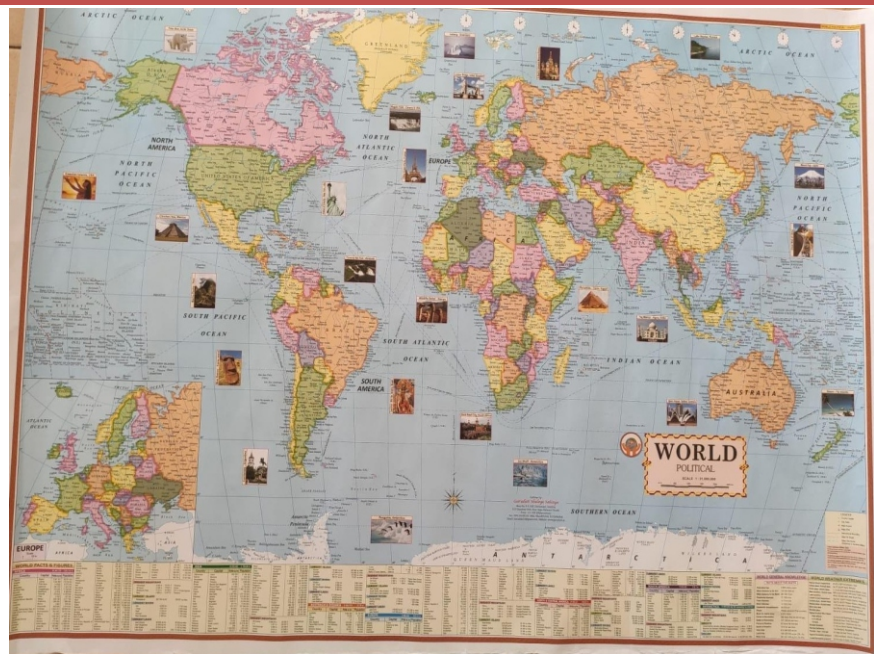
WORLD POLITICAL ENGLISH