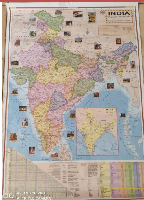
INDIA POLITICAL ENGLISH

Rs. 300/- AFTER SPECIAL DISCOUNT OFFER Rs. 207/-