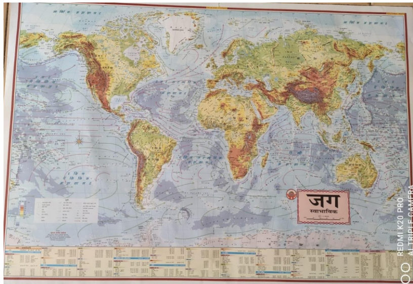
WORLD PHYSICAL MARATHI