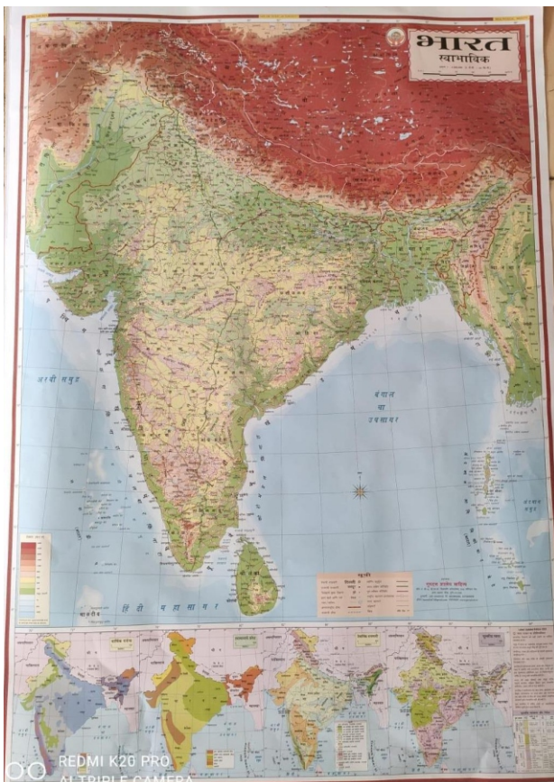
INDIA PHYSICAL MARATHI