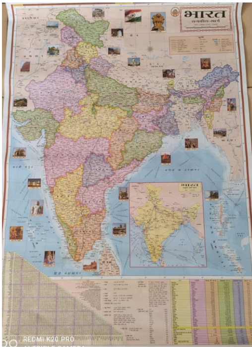
INDIA POLITICAL MARATHI