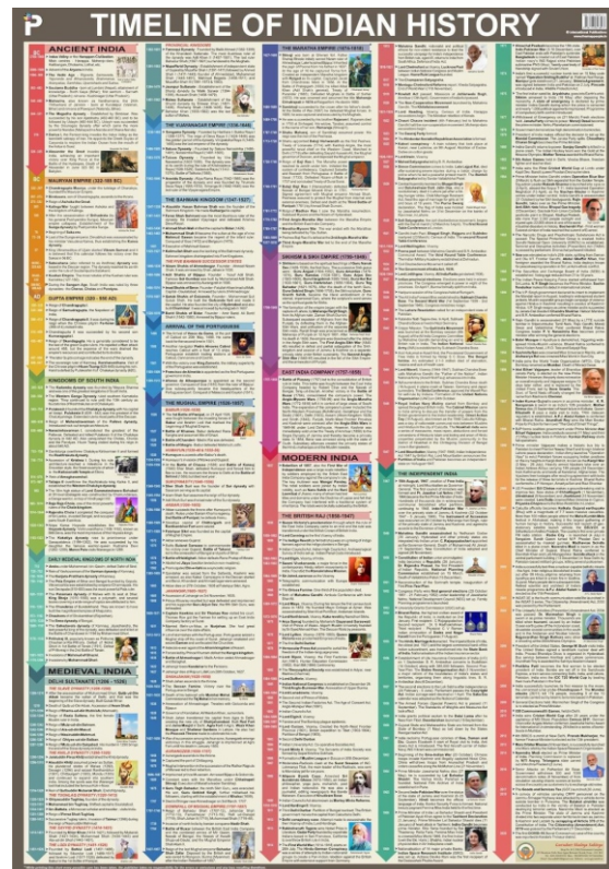
TIMELINE OF INDIAN HISTORY