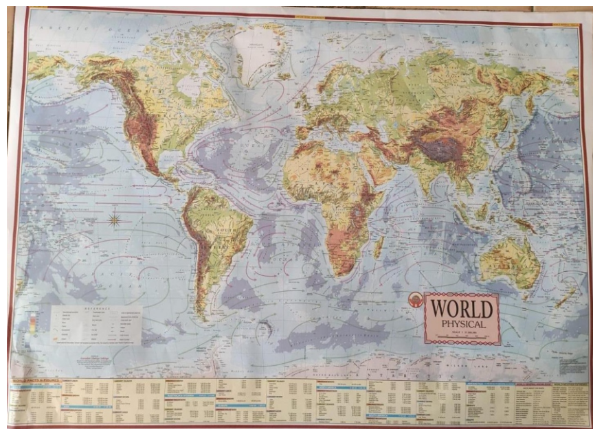
WORLD PHYSICAL ENGLISH