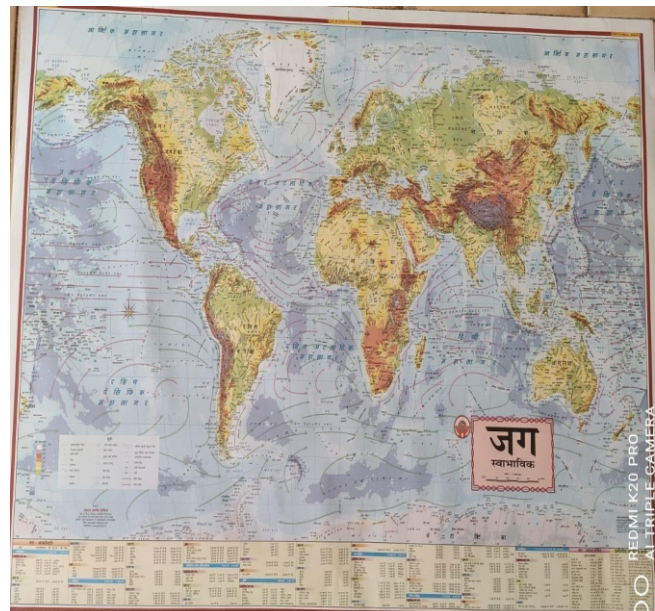
WORLD PHYSICAL MARATHI