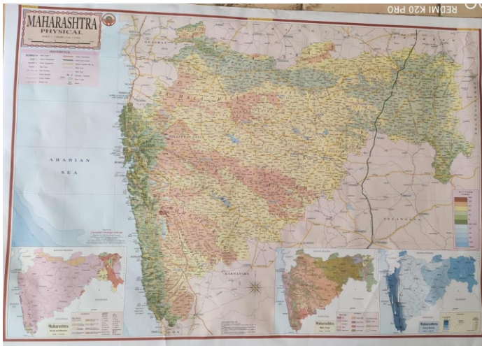
MAHARASHTRA PHYSICAL ENGLISH