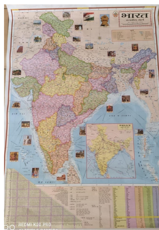
INDIA POLITICAL MARATHI