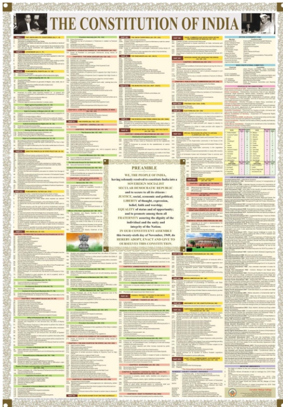
CONSTITUTION OF INDIA