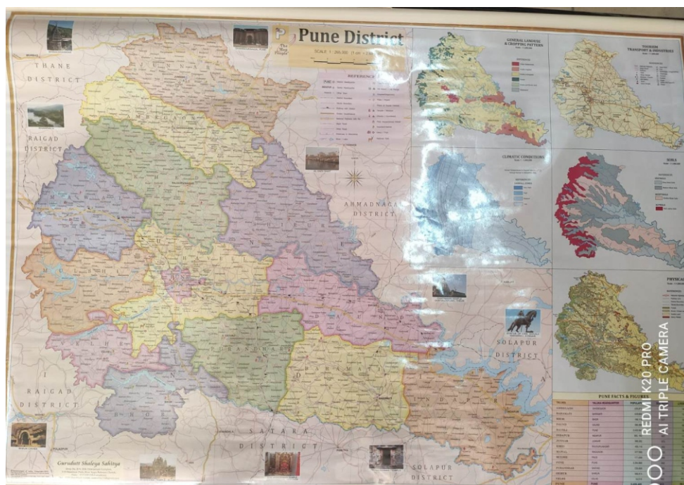
PUNE DISTRICT ENGLISH